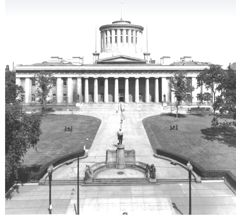
Statehouse, circa 1950

Commemorate your special date in history